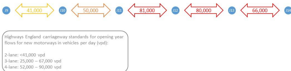
Figure 1: 2015 traffic count of daily vehicle flows on M11 around Cambridge