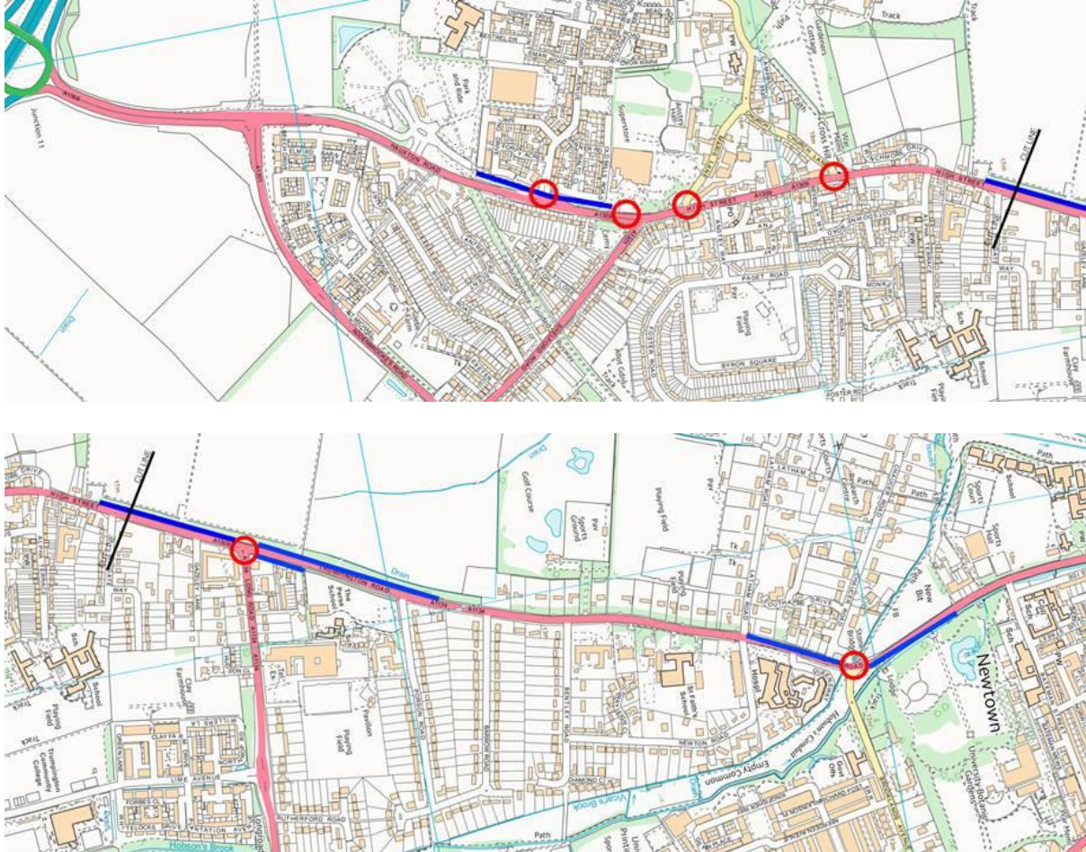
Figure 2: Potential Bus Priority Interventions Trumpington Road