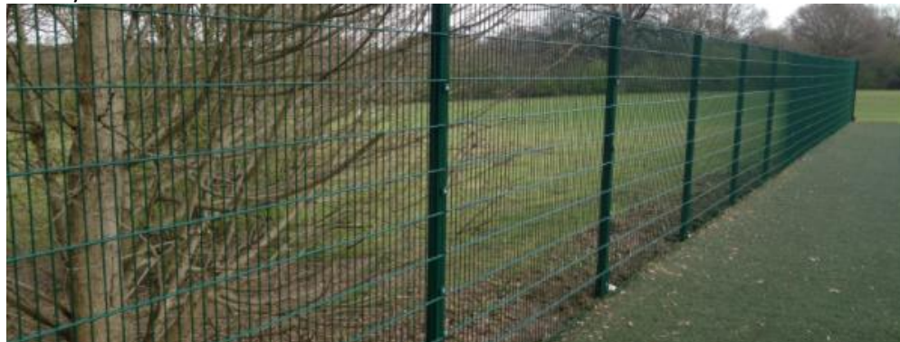
Figure 3: Example image of type of fence

The Scouts have approached the parish council for S137 funding, and will use their own funds for any remainder of the cost.